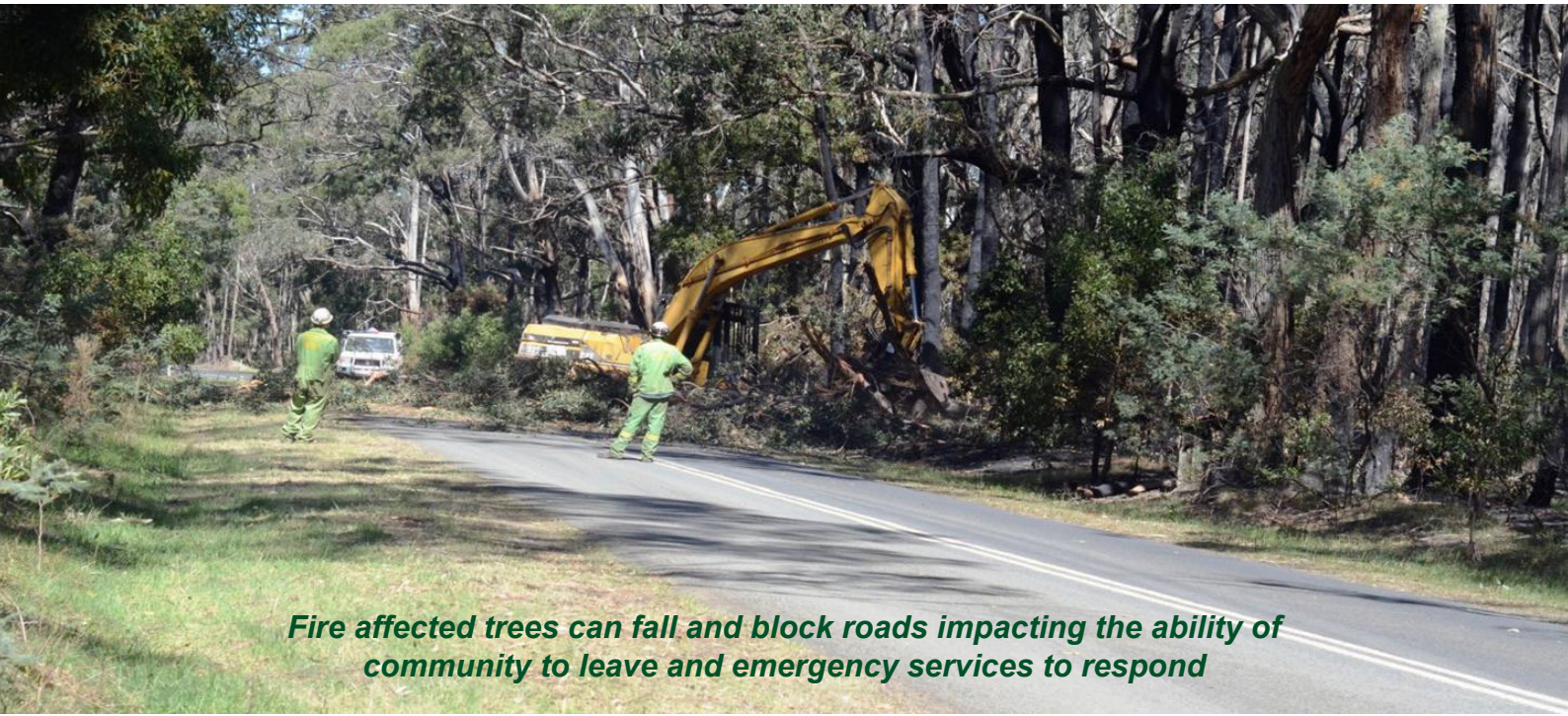
Fire affected trees can fall and block roads impacting the ability of community to leave and emergency services to respond