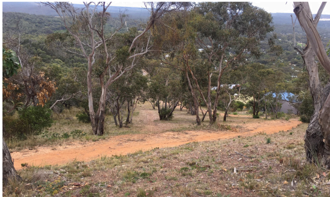
Ironbark Basin - Bells Beach

Strategic fuel breaks are approved under the planning scheme. Cultural heritage and biodiversity values have been thoroughly considered through the planning process.